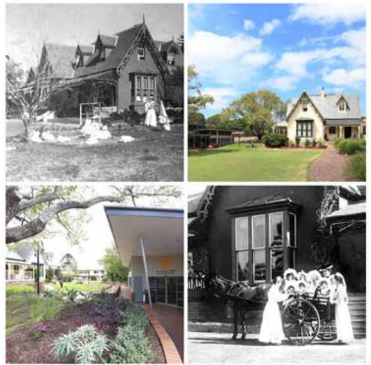
Gorton House, the original 10-bedroom Gothic house and how it looks today with the new Early Learning and Care Centre.