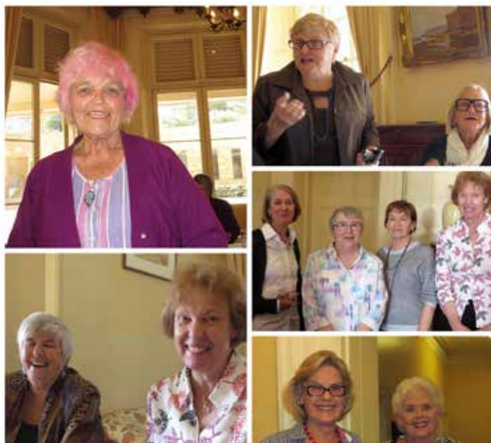
Old Girls at the 1957 Reunion enjoying time together.